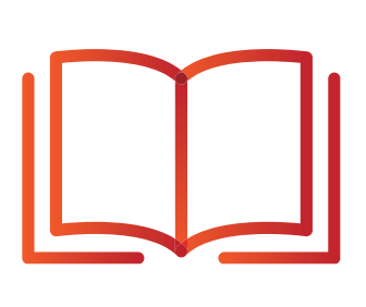
13% Increase in attendance in the Education Program from 2022

53% Of our visitors indicated it was their first time attending